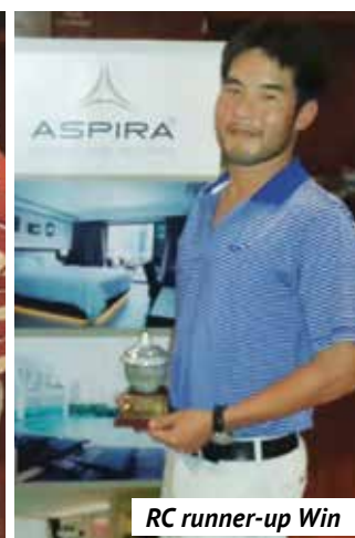
RC runner-up Win