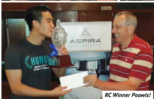
RC Winner Poowis!