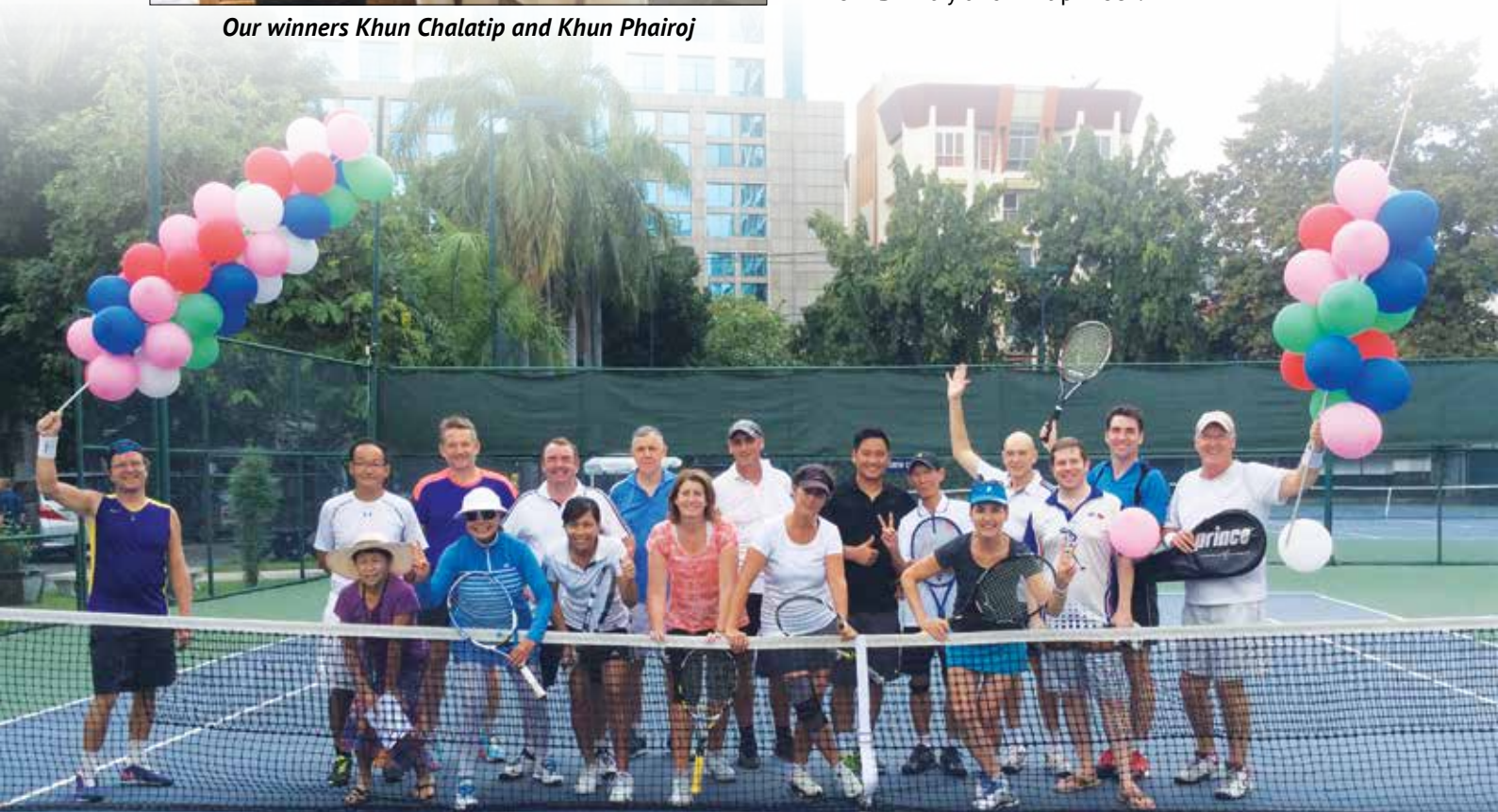
The full team