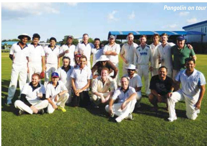
Pangolin on tour