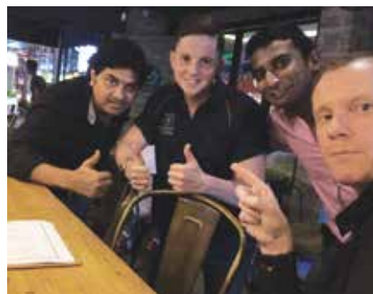
Team night out