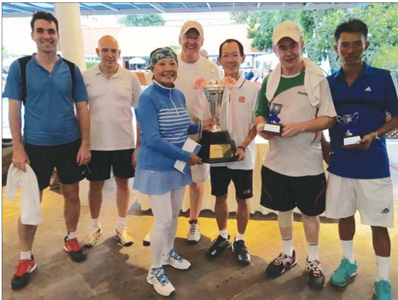
Our finalists and semi finalists