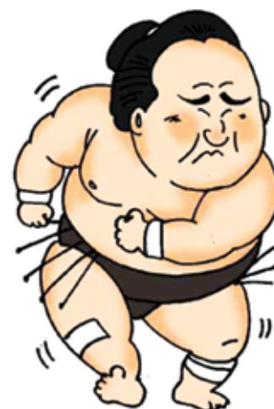
The old Me!

- my mum is from Hong Kong - I was starting to look like a sumo wrestler! So I went on a crash diet, started exercising like mad and it paid off. I was in the Plate final!