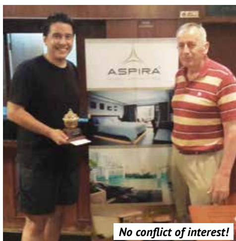
No conflict of interest!