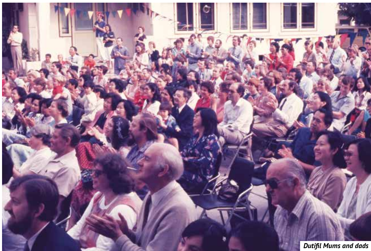
Dutiful Mums and dads