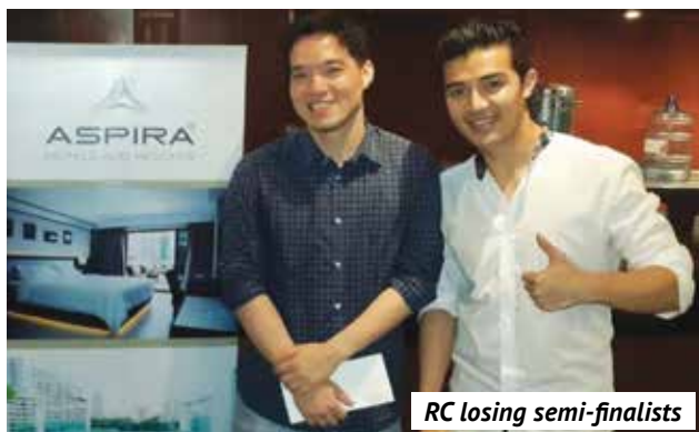
RC losing semi-finalists