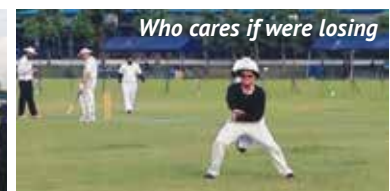
Who cares if we're losing