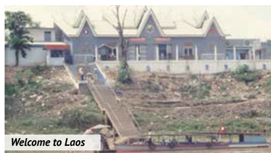
Welcome to Laos