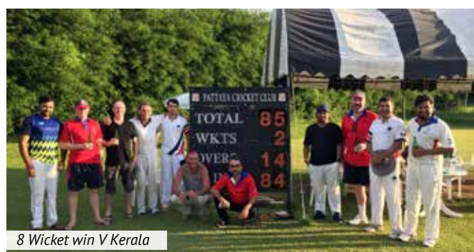
8 Wicket win V Kerala