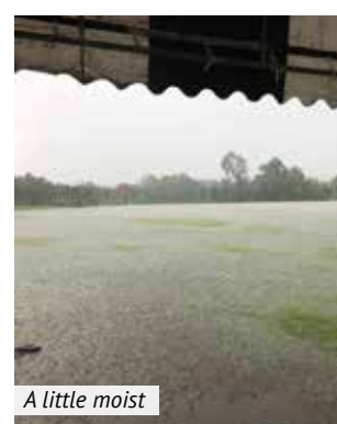
A little moist