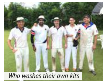
Who washes their own kits

On arriving at AIT after some time away from the Rangsit venue, BC were greeted with a freshly laid pitch and what seemed to be an unplayable outfield which had suffered from some overnight rain. However, with pressure from the league organisers and 2 equally stupid teams – the game went on after a somewhat ineffective technique to dry out the field. After fortunately winning the toss, BC ripped through a struggling Parrots side who were bowled out for under 50 in the tricky conditions, with most of their dismissals being clean bowled. A strong BC reply saw the total chased within 9 overs, equaling maximum points in the BCL bank.