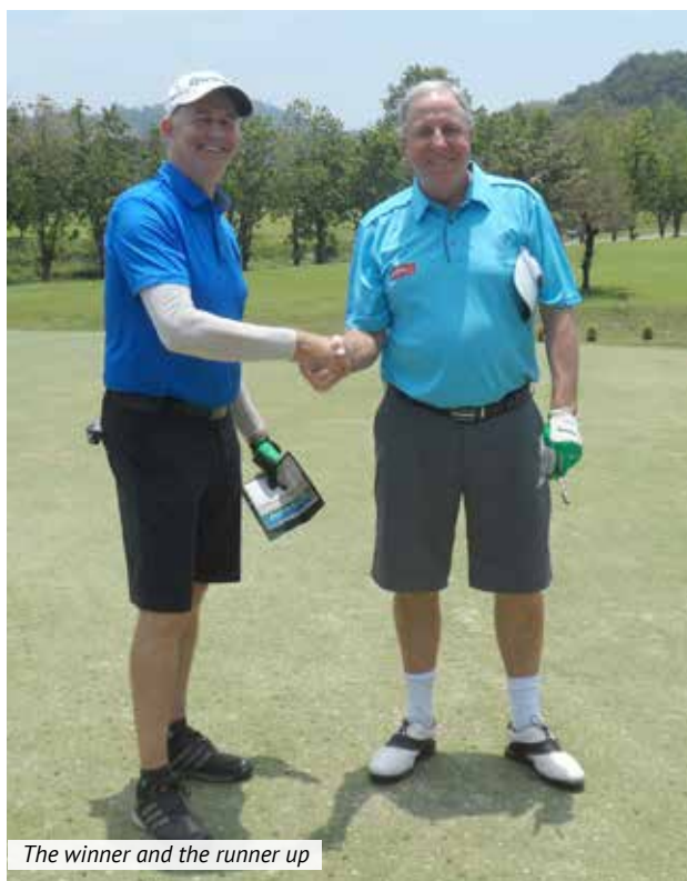
The winner and the runner up

On the second day in particular the weather was quite cool, one might even say chilly, in fact one would definitely say decidedly chilly, and some would say bloody cold! with some of us even needing to put on our jackets out on the course. Quite a contrast to the hot and sultry weather we are used to here.