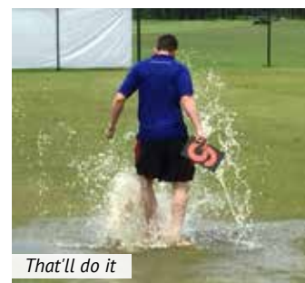
That'll do it

On arriving at AIT after some time away from the Rangsit venue, BC were greeted with a freshly laid pitch and what seemed to be an unplayable outfield which had suffered from some overnight rain. However, with pressure from the league organisers and 2 equally stupid teams – the game went on after a somewhat ineffective technique to dry out the field. After fortunately winning the toss, BC ripped through a struggling Parrots side who were bowled out for under 50 in the tricky conditions, with most of their dismissals being clean bowled. A strong BC reply saw the total chased within 9 overs, equaling maximum points in the BCL bank.