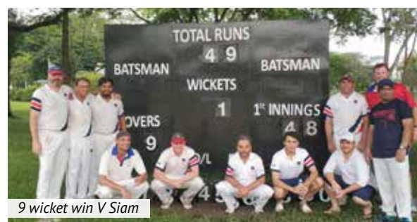
9 wicket win V Siam