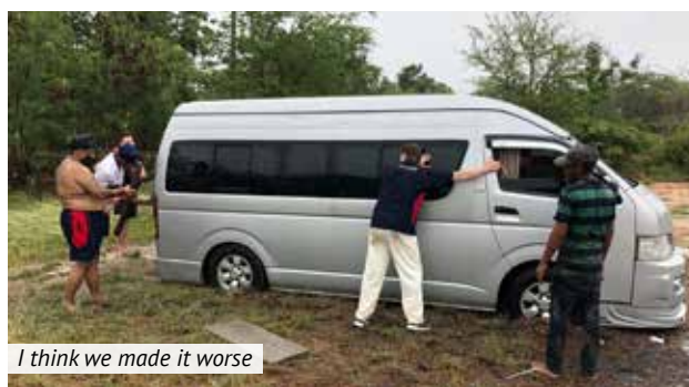
I think we made it worse

Players were greeted on Sunday morning by rain for the fixture against home side, Pattaya, which eventually rendered the field unplayable shortly after the 2 sides managed to squeeze in a few overs - perhaps foreshadowing the weeks to come.