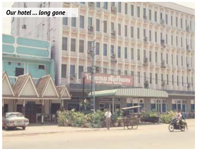
Our hotel ... long gone