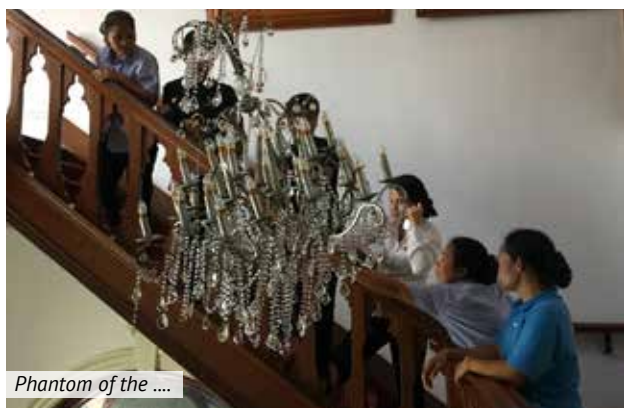
Phantom of the ....

In attendance was a small group of friends amongst whom was former Thai Prime Minister Anand Panyarachun, a former fellow Dulwich College old boy. Most touchingly several friends and colleagues came down from Hong Kong to pay their last respects.