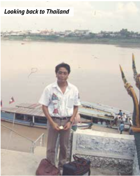
Looking back to Thailand