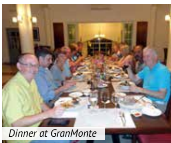
Dinner at GranMonte

But the weekends away are not just about the golf. On the Saturday evening a very pleasant dinner was enjoyed at the GranMonte wine estate. With complimentary words even being said about the award winning Thai wines they produce.