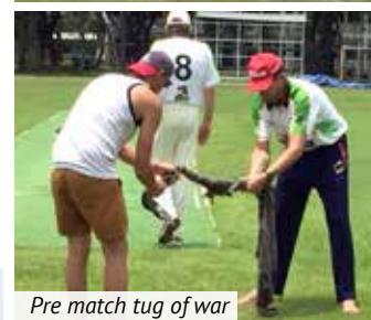
Pre match tug of war