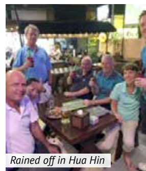
Rained off in Hua Hin

Sunday saw a reduced golfing field as the effects of the Saturday extended luncheon took its toll. Playing conditions were much improved and this wonderful course proved a great test of golf.