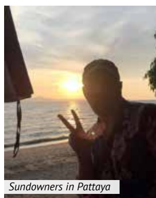
Sundowners in Pattaya