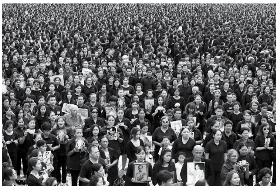
Reproduced with thanks

Speaking for all our Members in my capacity as Chairman of the General Committee, I wish to express our admiration for the tireless dedication of His Majesty King Bhumibol Adulyadej and our expectation that the memory of his accomplishments and of his spirit will live on forever.