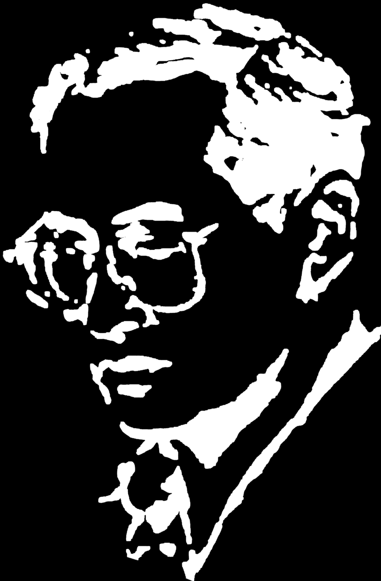
King Bhumibol Adulyadej 1927 - 2016