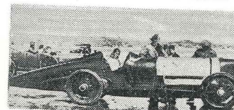
In 1924 Malcolm Campbell, in his Napier, pushed the world land speed record to 147 mph. On Castrol oil.

For over 75 years, Castrol's sole purpose has been to develop oils and lubricants of unsurpassed quality. 1899 saw the dawn of a new mechanical age. It took men of vision and genius to invest in its development. One such man was Charles Wakefield. He foresaw the beginnings of a massive new technology and a vast new market for lubricants. In 1909, he introduced a name destined to become world famous. Castrol.