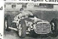
As cars developed, so did Castrol. In 1953 Castrol pioneered the world's first multigrade oil, for cars like this 16 cylinder B.M.W.

Cars became faster, lighter and were powered by higher revving engines. Once again Castrol anticipated the trend and pioneered the world's first oil with additives. Patent Castrol. In 1953, Castrol launched Castrolite, the world's first ever multigrade oil.