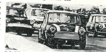
In the 1960's, works Mini Coopers like this beat the rest of the world. On Castrol oil.

The Jet age. Once again Castrol met the challenge. Producing the world's finest jet engine lubricants. Castrol 98. The 1960s brought front wheel drive and overhead camshafts. Higher power outputs than ever before. Castrol developed a new revolutionary antiwear additive. Liquid Tungsten. By the 1970s, family cars were moving faster than yesterdays sports cars. And so to the ultimate oil. Castrol GTX, the high performer. Britain's leading motor oil.