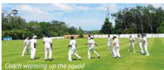
Coach warming up the squad