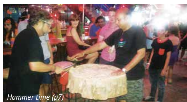
Hammer time (p7)