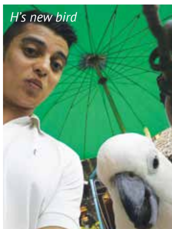
H's new bird