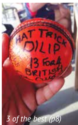
3 of the best (p8)