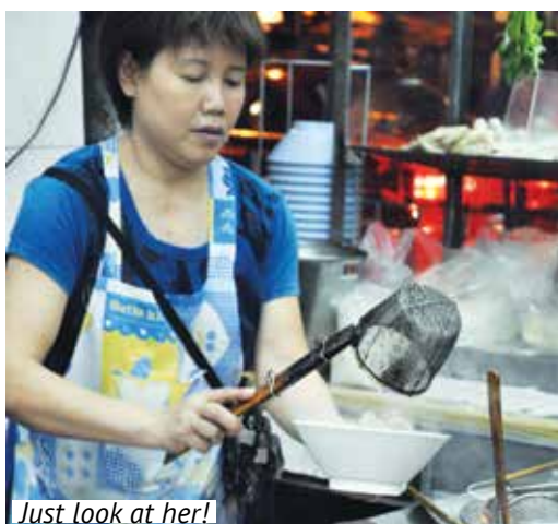
Just look at her!

A young, newly-wed (5 years) BCB, FF Manager was recently asked by his wife on a Thursday evening what the following day was, (she feared he'd forgotten their wedding anniversary again as he had the previous year) and the young man replied rather too enthusiastically that it was bloody Friday and thanks for reminding him as he needed to check if Agüero was fit as he wanted to put him in as his captain as Man City were home to Villa that weekend and he expected a bloodbath! Typical! And it won't surprise you to learn that this sad fellow is now a young, newly-divorced (5 weeks) BCB, FF Manager!