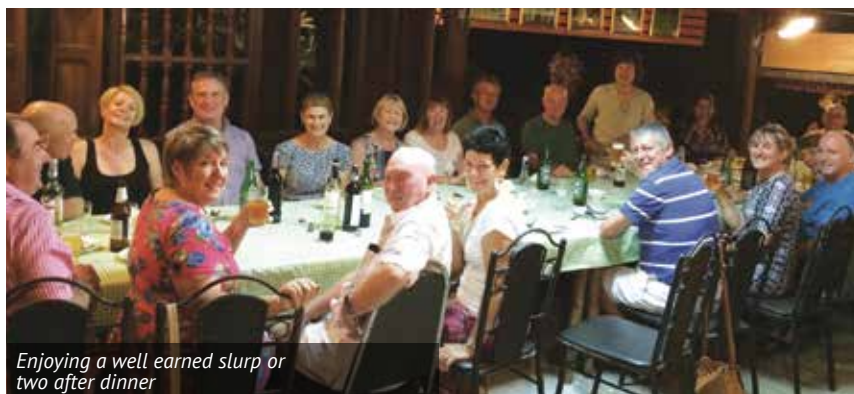
Enjoying a well earned slurp or two after dinner