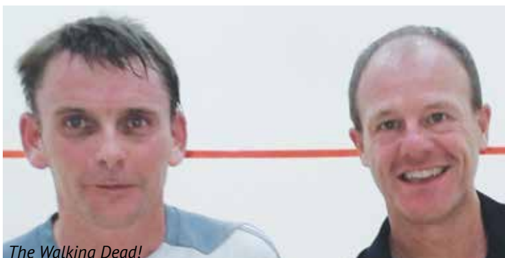
The Walking Dead!