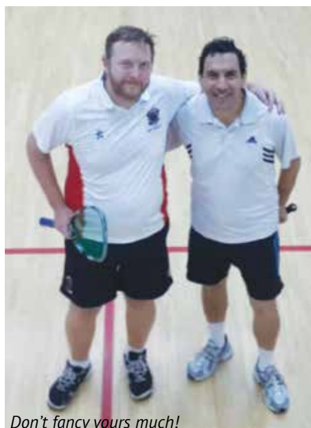
Don't fancy yours much!