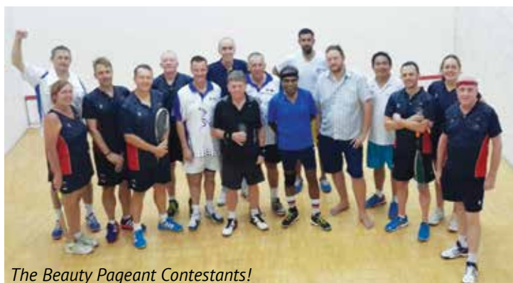
The Beauty Pageant Contestants!