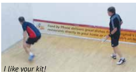
I like your kit!