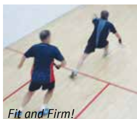
Fit and Firm!