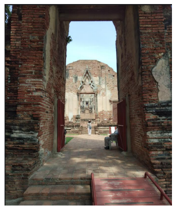
(Wat Rachaburana after the Burmese destruction)

Since 1969 the Fine Arts Department of Thailand has been undertaking renovations of the ruins, scaling up the project after the site was declared a Historical Park in 1976. This has resulted in the discovery of thousands of ornaments and objects, most made of pure gold, others of silver, together with various pottery items, all testament to the wealth of the city during its prime. All of these formed the basis for the construction and opening in November 2022 of a new fully airconditioned wing at the Chao Sam Phraya National Museum to house "The Golden Treasure Exhibition" covering all 8 rooms on the 2<sup>nd</sup> floor, displaying 2,244 pieces of the above-mentioned items.